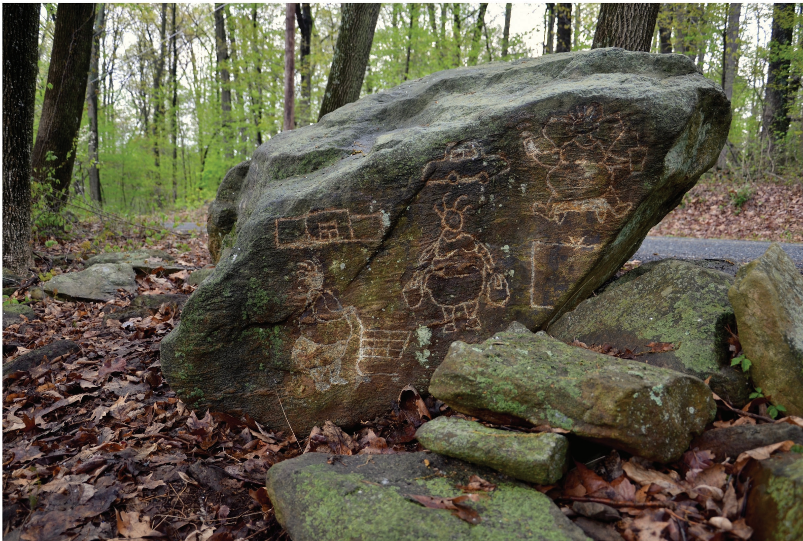
PopCorn Rock, 2016, site-specific project in New Jerusalem PA, petroglyphs on stone, 45"x 100"x 80"